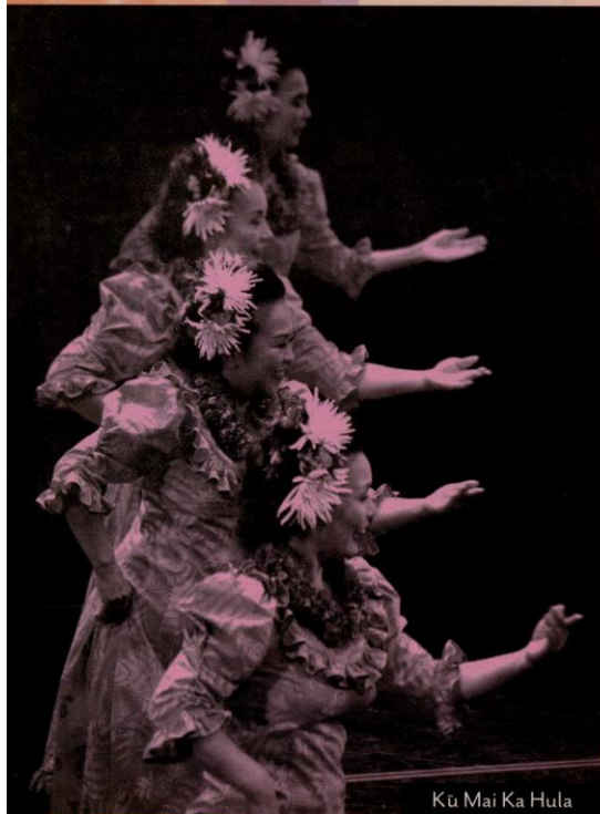
Kū Mai Ka Hula

TICKETS: $25 adults • $12.50 kids 12 years & under