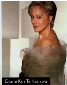
Dame Kiri Te Kanawa